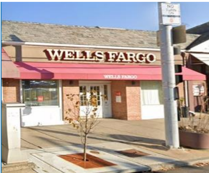
North Avenue Exposure

*Located in the Highly Affluent Wykagyl Neighborhood of New Rochelle along the Scarsdale Border*